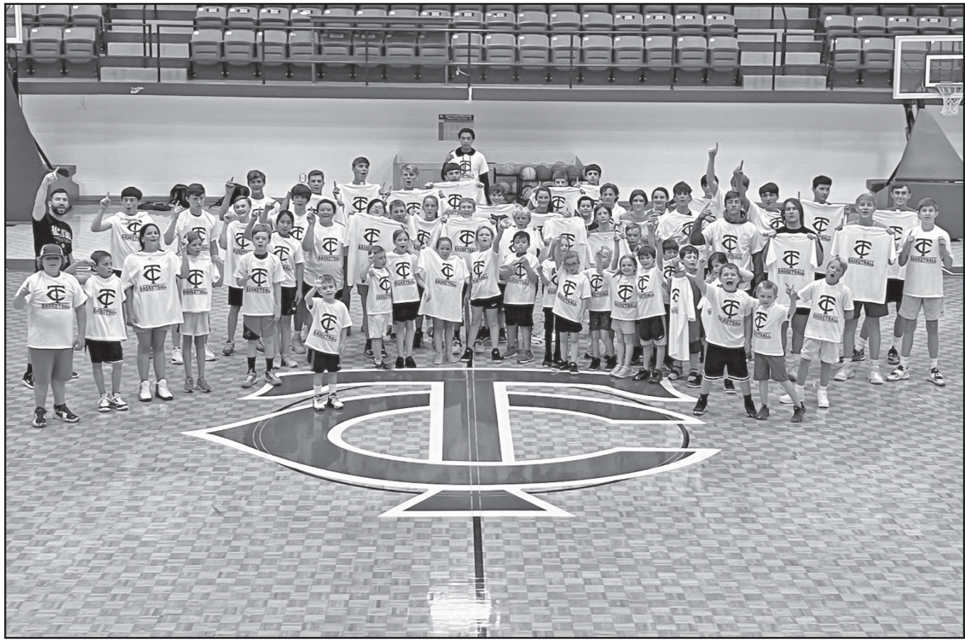
More than 50 local youngsters attended last week's Towns County High School basketball youth camp.